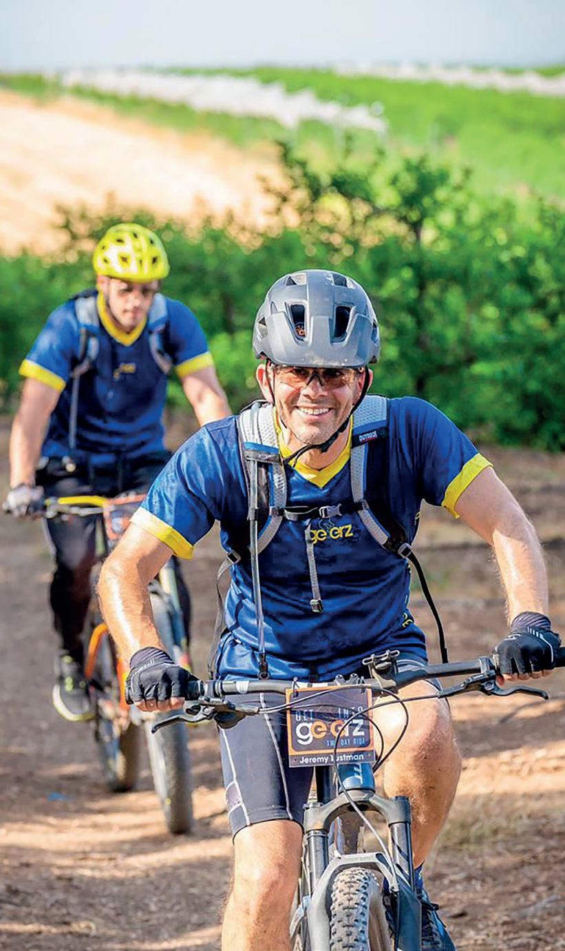
Geerz charity bike ride