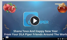
HAPPY JEWISH NEW YEAR FROM AROUND THE WORLD