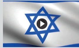
ISRAEL INDEPENDENCE DAY