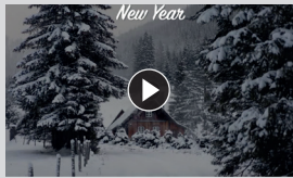
HAPPY NEW YEAR

See our team's videos featuring key highlights from 2022.