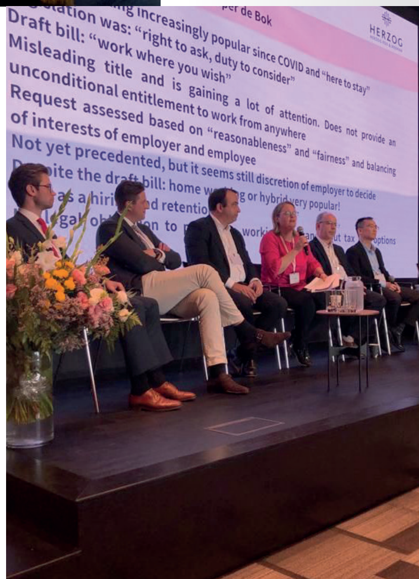
Labor and Global Employment Forum