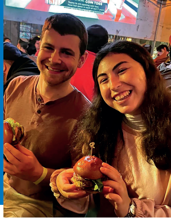
Super Bowl party

In honor of the back-to-back Israel Memorial and Israel Independence Days in May, we co-hosted a barbeque for soldiers through PizzaIDF, an organization that delivers pizza and other food gifts to IDF soldiers around the country.