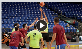
DLA PIPER CHARITY BASKETBALL TOURNAMENT