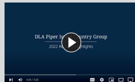
2022 YEAR IN REVIEW