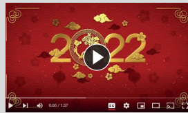
CHINESE NEW YEAR