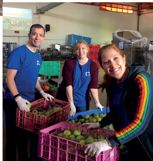
Volunteering at Leket Israel

Finally, in November, we co-sponsored the annual Ezer Mizion golf tournament at the Caesarea Golf Club to help raise awareness and funds for the world's largest Jewish bone marrow registry.