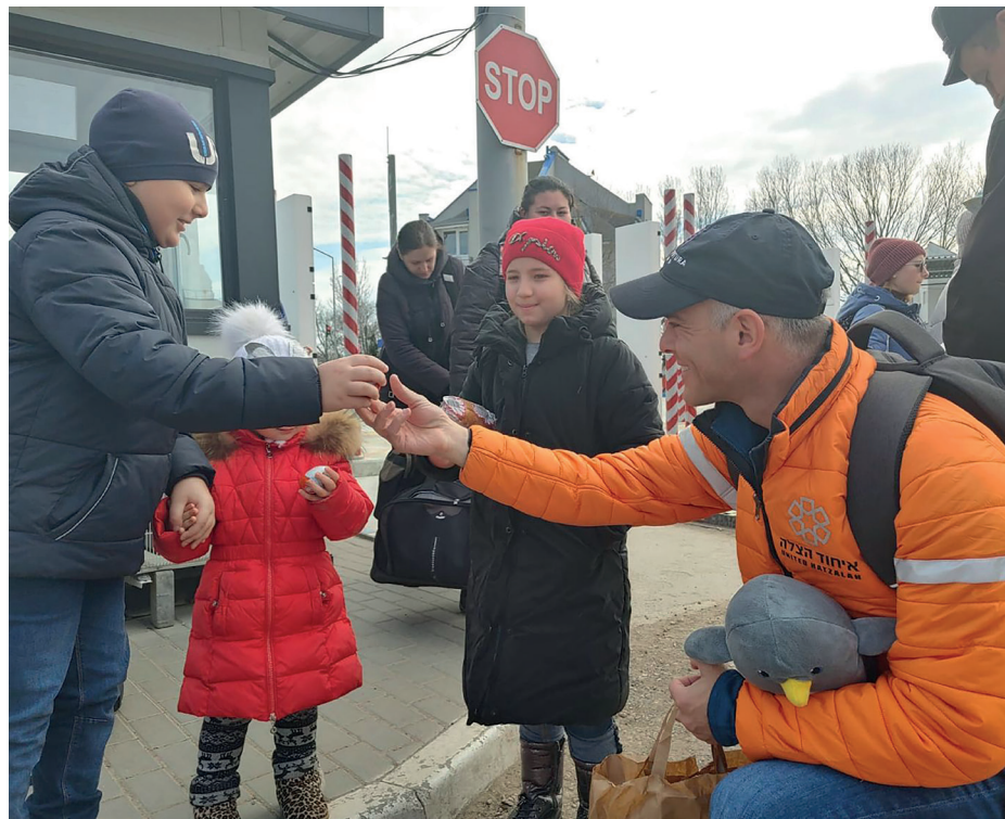
Right Alongside United Hatzalah of Israel at the Moldova-Ukraine border