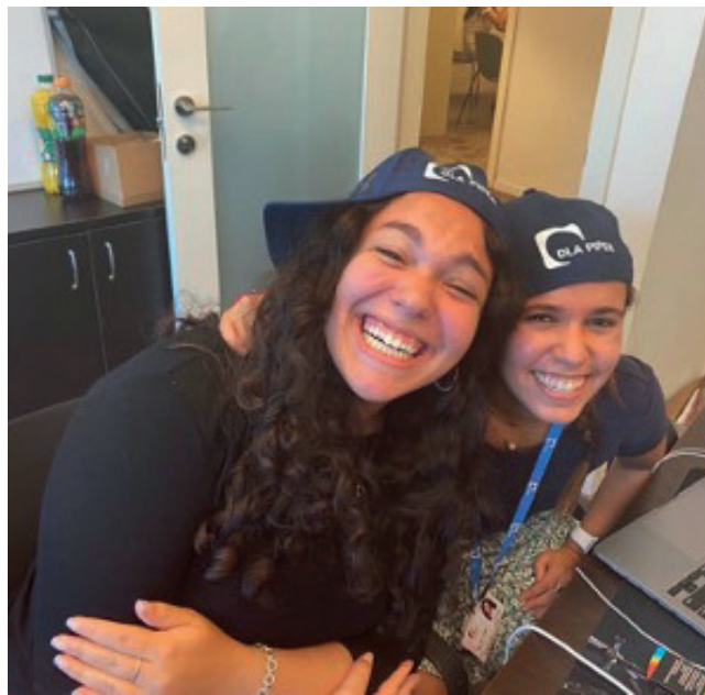
Top: Colleagues from our Dubai office