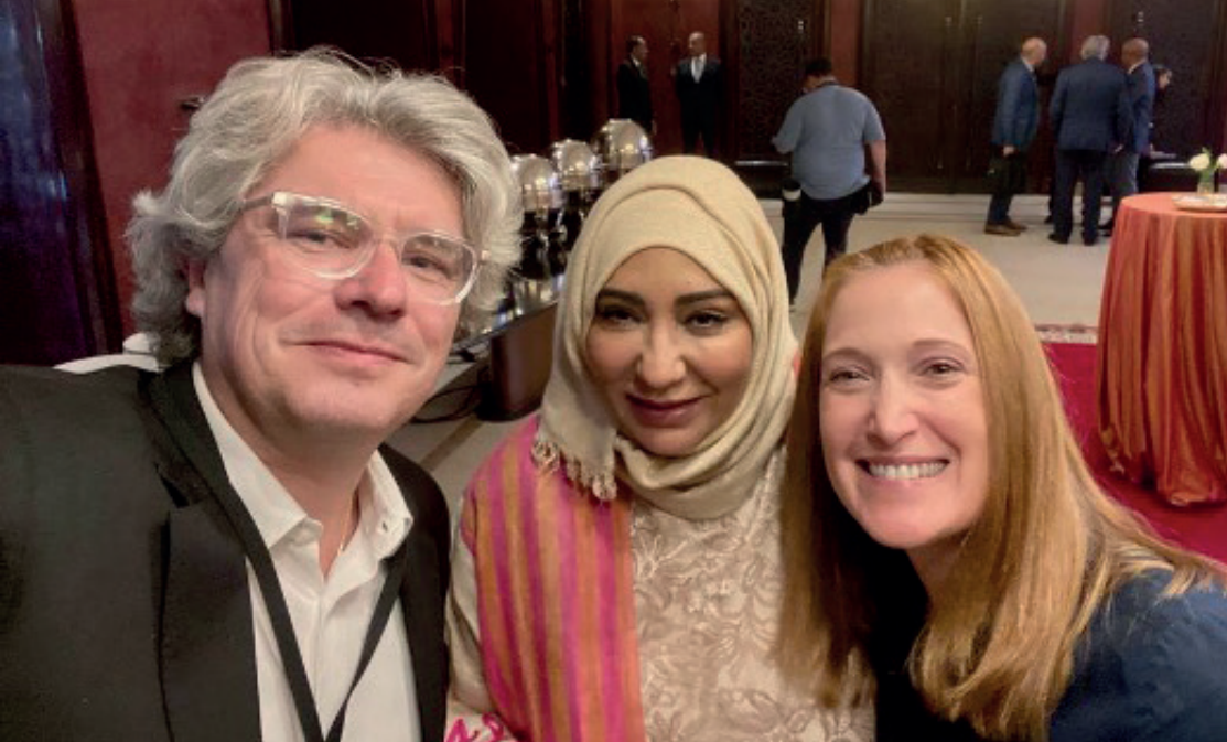
Jerusalem Post Global Investment Forum in Marrakesh

In November, we were joined by 11 employment colleagues from around the world who took part in our first in-person Labor and Global Employment Forum since the pandemic, co-hosted with Israeli law firm Herzog and the Israel branch of the ACC.