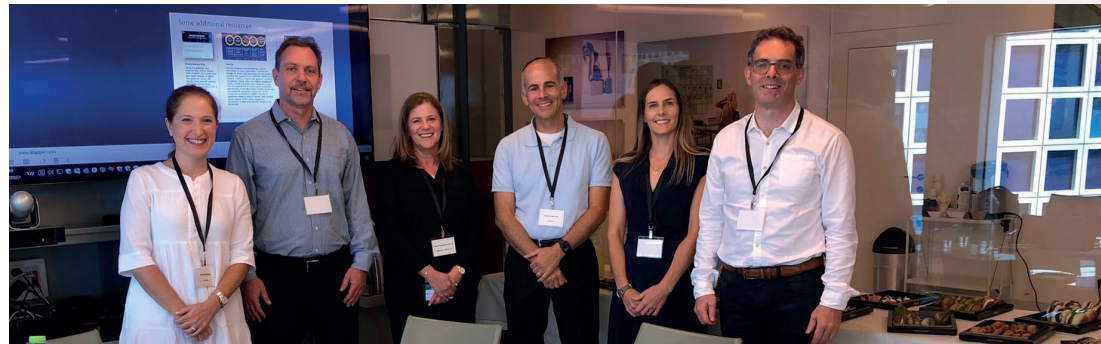
Roundtable discussion on emerging data privacy and AI regulation in the EU/UK

In May, we hosted a virtual discussion on how the escalating sanctions and export control restrictions imposed on Russia, Belarus, and the Russian-occupied regions of Ukraine apply to Israeli companies doing business in those countries.